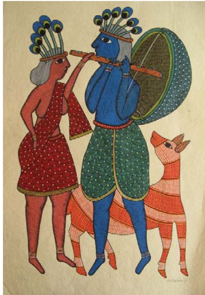
Figure 3: Gond painting of a Flute Player with blue skin and wearing a peacock plumes head-dress.

Lingo's musical ability is very similar to that of Krishna's. Krishna, too, used play mesmerizing tunes on his flute that induced the gopis of Vrindavan to forget their families and join the ras lila (dance of love). In the South Indian tradition, the idea of Krishna as a versatile and heroic dancer is deeply entrenched. A majority of the dances and songs of India have been inspired by Krishna's ras lila, just as the dances of the Muria Gonds have been inspired by Lingo.