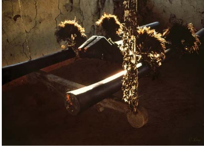
Figure 11: A shrine of Lingo, at the outskirts of the village Remawand. The shrine, housing his statue carved from wood, rests on a palanquin, which is suspended from a swing.