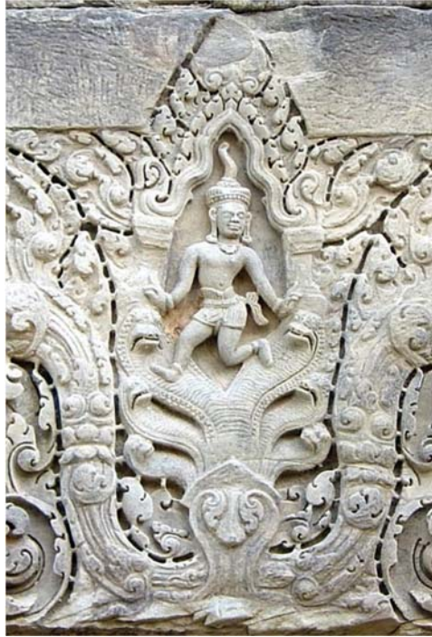
Figure 9: Krishna Subduing Kaliya, Ban Phluang, Thailand, 1050-1066 AD.

Another interesting connection is with respect to the Bindo bird. Lingo had befriended the paternal Bindo bird, and rode on him all the way from the sea-shore to the Dhawalgiri Mountain (Himalayas) in order to free the captive Gonds. Krishna, too, rode on a massive bird called Garuda . There is a story in the Bhagavata Purana of the demon king Narakasura, who had abducted and enslaved sixteen thousand women. Krishna, riding on Garuda, attacked the fortress of Narakasura, killed him in combat, and freed all the women.