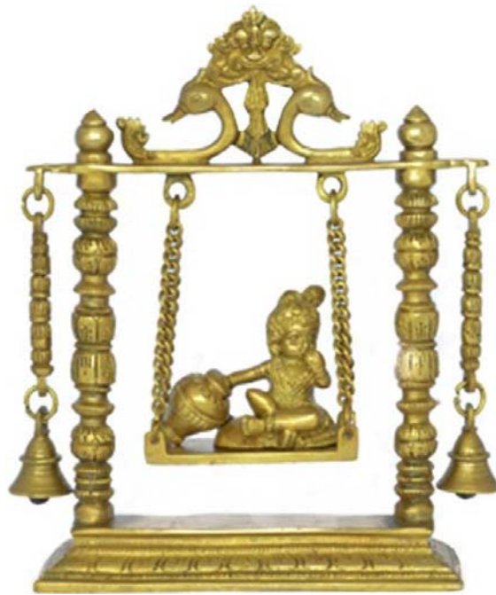
Figure 12: Baby Krishna on a swing decorated with peacocks.

During their festivities, the Maria Gonds of Bastar place a wooden statue of Lingo on his Anga (shrine in the form of a palanquin) decorated with peacock feathers, swing it around, and carry it through their village. Similar palanquin processions take place throughout India to celebrate different festivities associated with Krishna. For instance, during the Dol Purnima (Holi) festival in many parts of Eastern India, the idols of Krishna and Radha are placed on a decorated palanquin and carried to each house in the village in procession, led by the village drummers, pipers, and singers. The celebration culminates in a swing festival for the deities, when they are placed on a swing and rocked, to the accompaniment of devotional music. 10