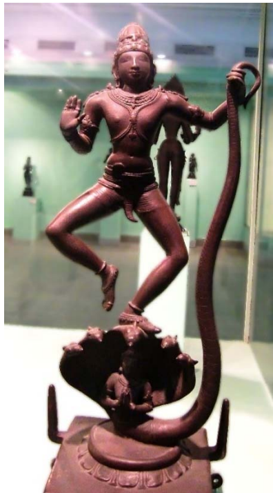
Figure 8: Krishna dancing on the Kaliya serpent. Chola bronze. National Museum of India, New Delhi.

To someone, familiar with the story of Krishna, it will be difficult to miss the resemblance between the killing of the serpent Bhawarnag by Lingo, and that of the black serpent Kaliya by Krishna. As per the Puranic accounts, Kaliya was a massive, venomous, multi-hooded, snake which had entered the blue waters of the Yamuna. Its poisonous fumes killed the birds, plants, and trees of the region. Krishna had jumped on the hoods of the serpent, smashing its heads, until the severely wounded serpent agreed to return back to the ocean. In both cases the hoods of the serpent were smashed by the hero , but while Lingo had killed the serpent, Krishna had let the wounded serpent go.