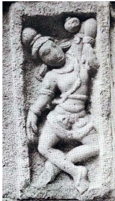
Figure 5: Krishna doing the pot dance. Pundarikaksha Temple, Tiruvellarai.