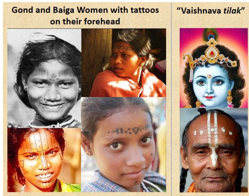
Figure 14: The Vaishnava tilaks on Gond and Baiga women

The cultural correlations are as compelling as the mythological ones, and provide more support in favor of the argument that Lingo and Krishna are one and the same.