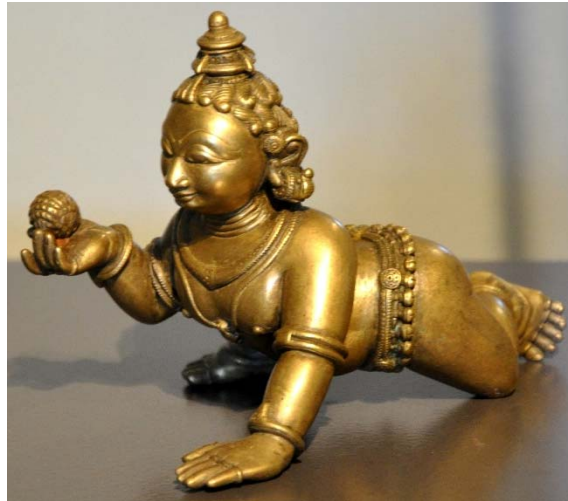
Figure 2: Infant Krishna holding a ball of butter. Orissa, c. 1800 CE, bronze. Museum Rietberg, Zurich.

Let us return to the story. When Lingo was nine years old , he found the four Gond brothers who had escaped captivity and were living at Kachikopa Lohagarh . He became like their brother, and taught them how to cultivate rice, hunt animals, make a fire, and cook.