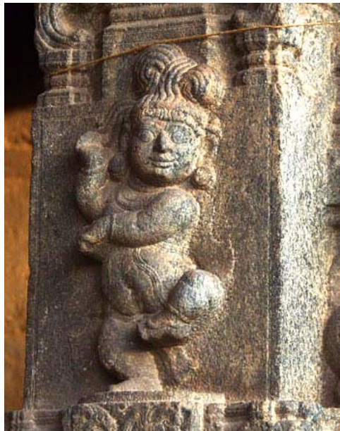
Figure 1: Dancing Baby Krishna. Jalakandeswarar Temple, Vellore, c.1550 CE.