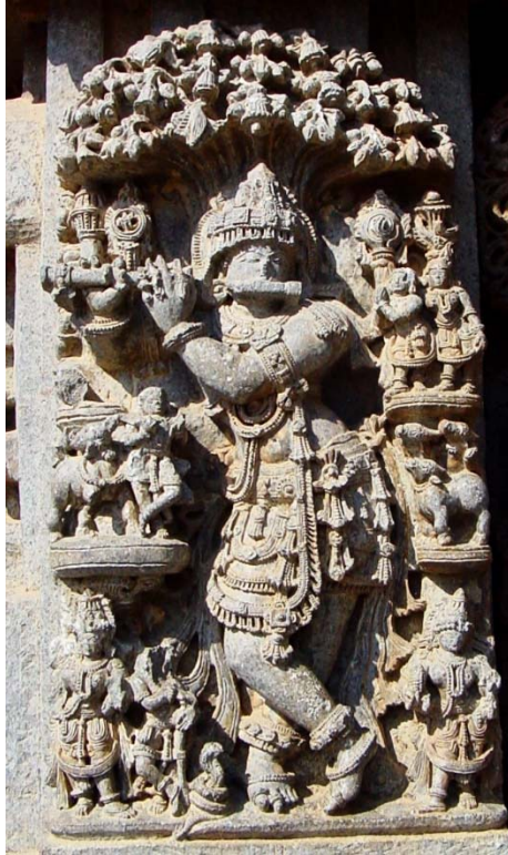
Figure 4: Krishna playing the flute beneath a tree, surrounded by gopis. Chennakeshava Temple, Somnathpur.