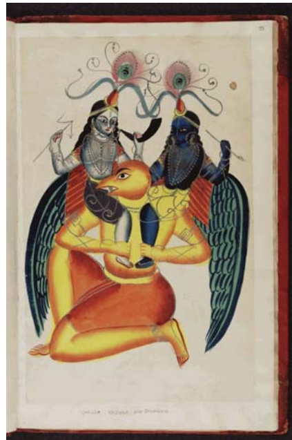
Figure 10: Garuda carrying Krishna and Balarama.

Another interesting connection is with respect to the Bindo bird. Lingo had befriended the paternal Bindo bird, and rode on him all the way from the sea-shore to the Dhawalgiri Mountain (Himalayas) in order to free the captive Gonds. Krishna, too, rode on a massive bird called Garuda . There is a story in the Bhagavata Purana of the demon king Narakasura, who had abducted and enslaved sixteen thousand women. Krishna, riding on Garuda, attacked the fortress of Narakasura, killed him in combat, and freed all the women.